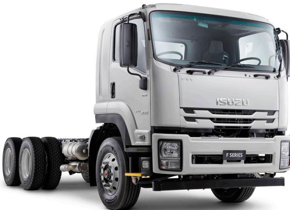
FVY 240-300 model pictured

* Satellite Navigation functions and maps provided at no extra cost, with up to four quarterly updates provided by user free download for the first three years of ownership, after which updates can be purchased at additional cost.