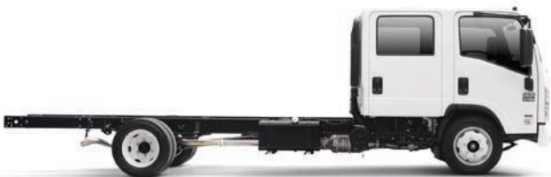
NQR 450 Crew