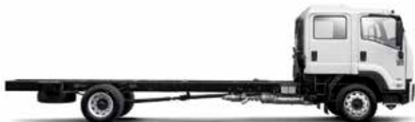
FTR 900 Crew