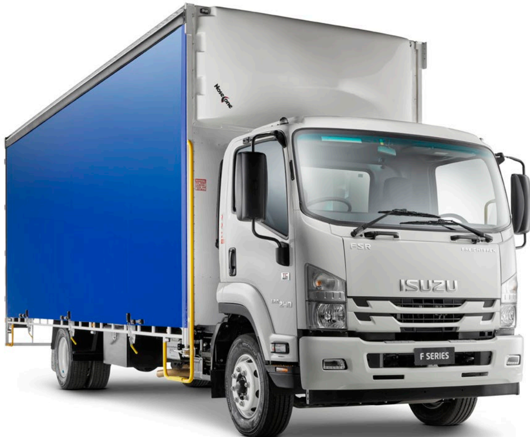
FSR 120-240 Freightpack

* Satellite Navigation functions and maps provided at no extra cost, with up to four quarterly updates provided by user free download for the first three years of ownership, after which updates can be purchased at additional cost.