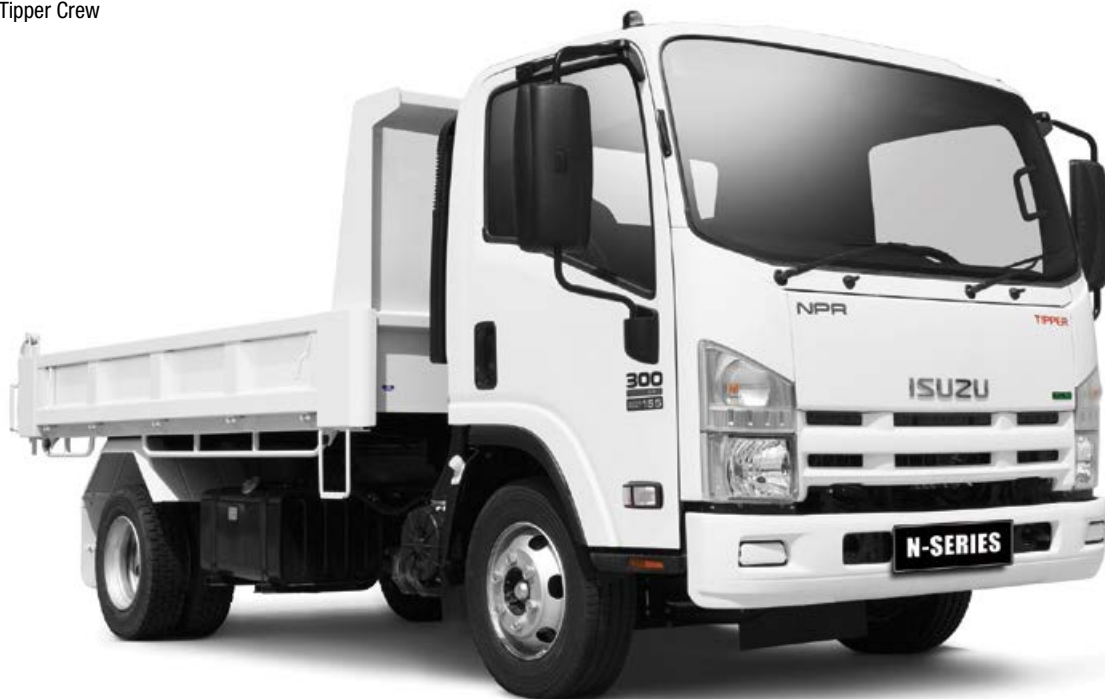
NPR 300 Tipper

AUSTRALIA'S TOP SELLING TRUCK BRAND SINCE 1989.