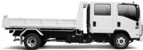
NPR 300 Tipper Crew