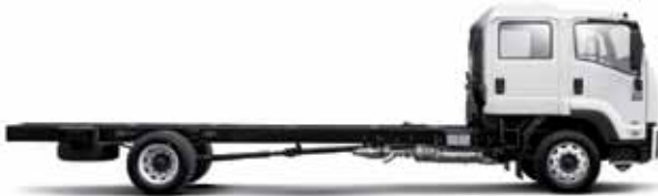
FTR 900 Crew