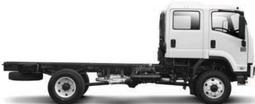
FTS 800 Crew