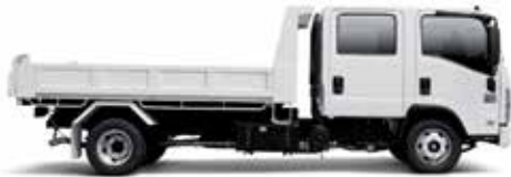
NPR 300 Tipper Crew