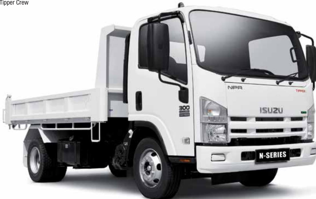
NPR 300 Tipper

AUSTRALIA'S TOP SELLING TRUCK BRAND SINCE 1989.