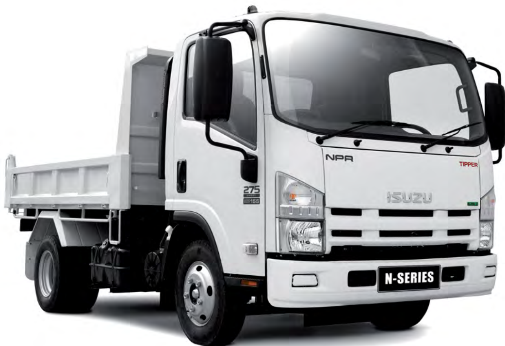
NPR 275 Tipper pictured

AUSTRALIA'S TOP SELLING TRUCK BRAND SINCE 1989. Truck tracker 2009.