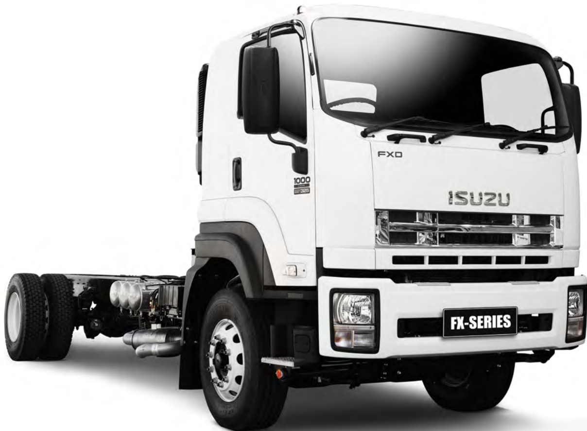
FXD 1000 pictured

AUSTRALIA'S TOP SELLING TRUCK BRAND SINCE 1989. Truck tracker 2009.