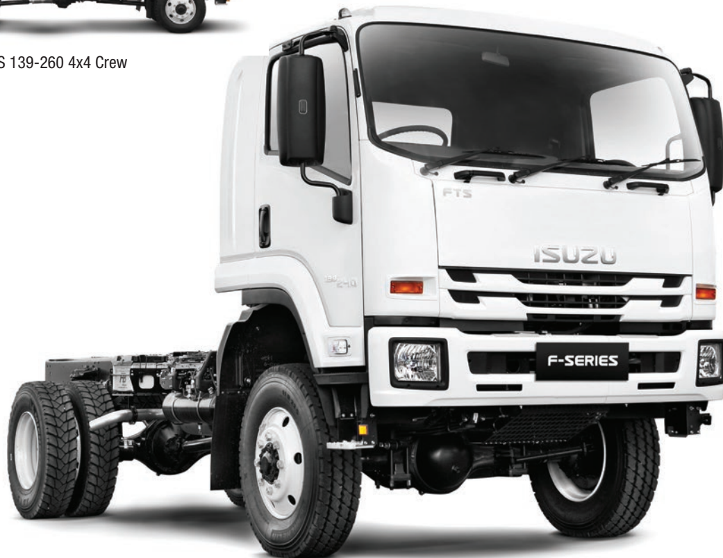
FTS 139-260 4x4