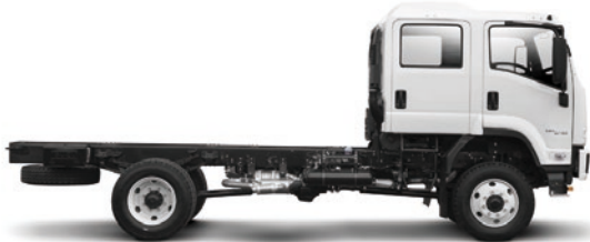
FTS 139-260 4x4 Crew