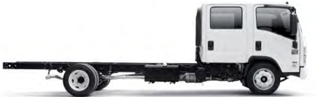
NQR 450 Crew