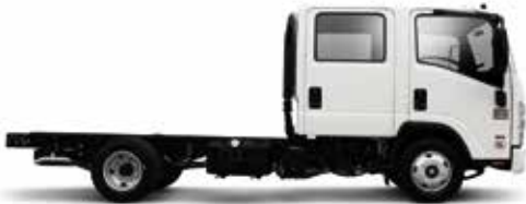
NNR 200 Crew