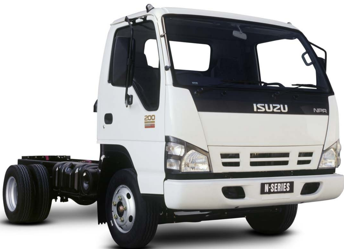
NPR 200 Short SRS pack pictured