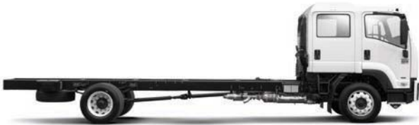
FTR 900 Crew