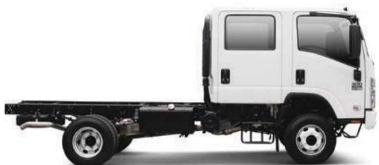
NPS 300 Crew