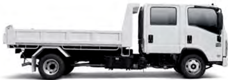
NPR 300 Tipper Crew