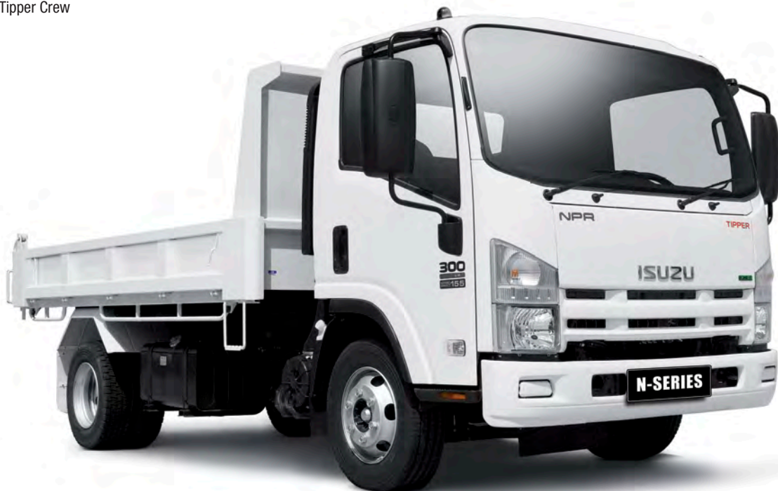
NPR 300 Tipper

AUSTRALIA'S TOP SELLING TRUCK BRAND SINCE 1989.