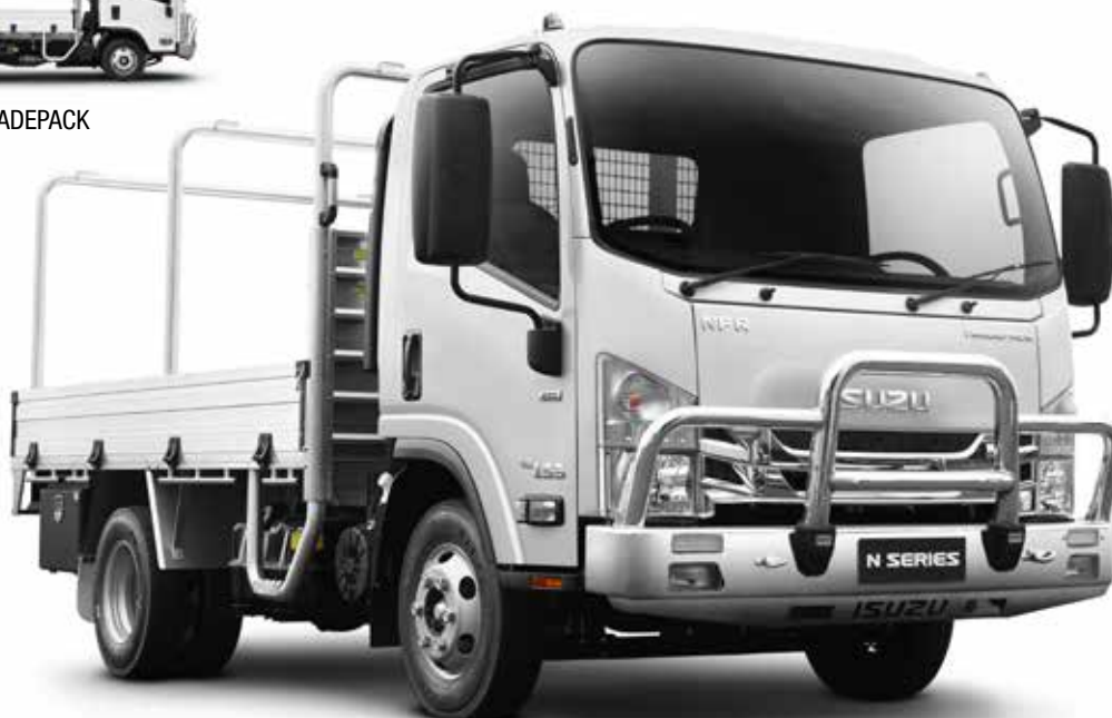
SWB PREMIUM TRADEPACK

Heavy duty aluminium tray / Heavy duty galvanised ladder racks Integrated load restraint anchor points / Headboard including rear window protector / Removable drop sides and rear tailgate Isuzu satellite navigation and reversing camera / Genuine Isuzu Bullbar and 3,500 kg rated towbar