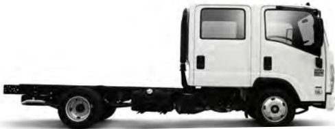
NNR 200 Crew