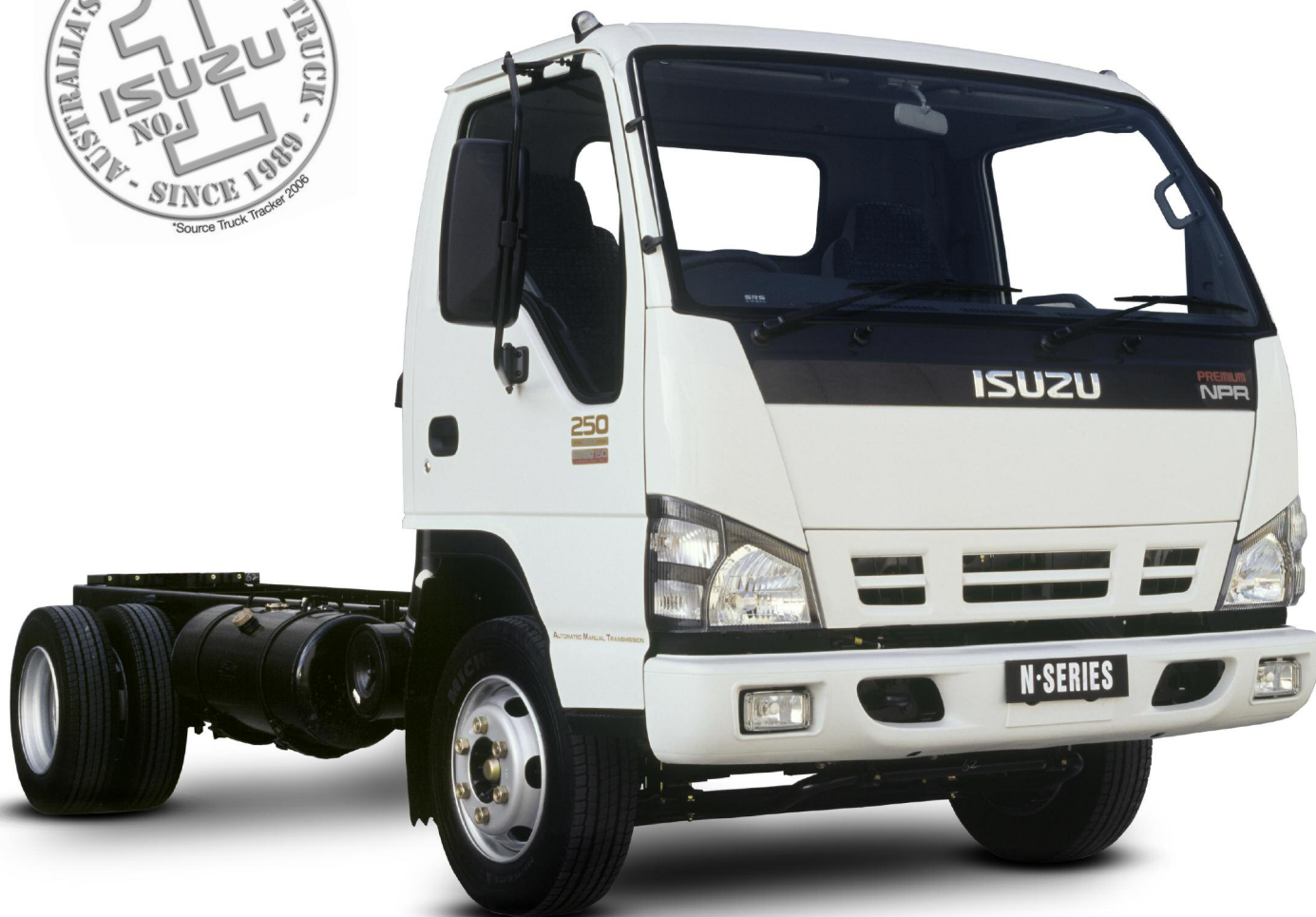
NPR 250 Medium Premium pack pictured