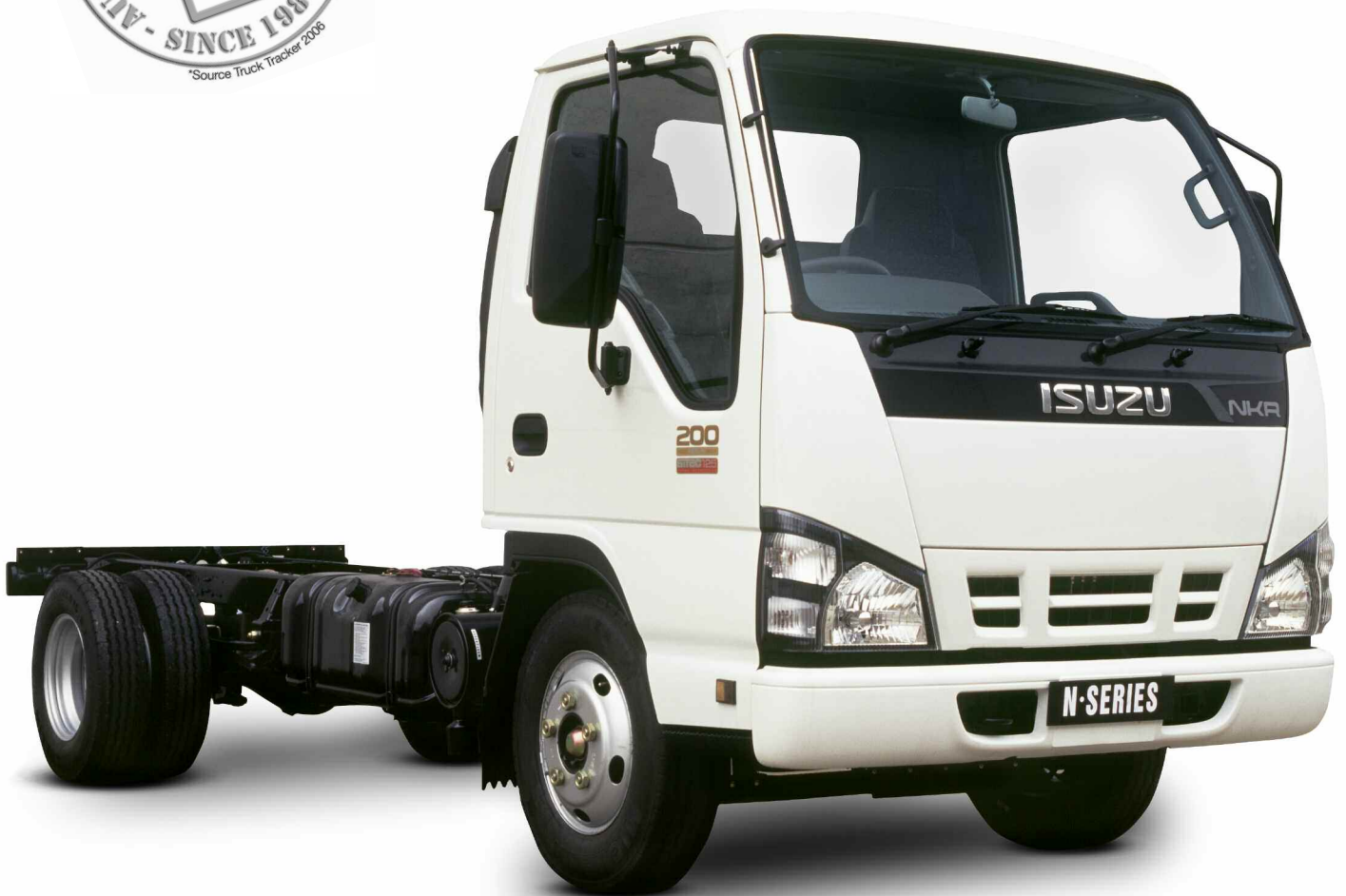
NKR 200 Medium pictured