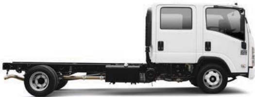
NPR 300 Crew