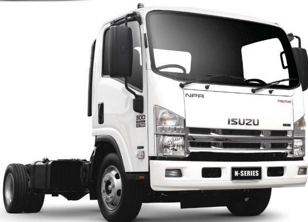
NPR 300 Premium

AUSTRALIA'S TOP SELLING TRUCK BRAND SINCE 1989. Truck tracker 2007.