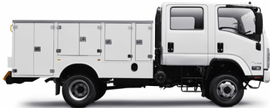
NPS 75-155 Crew Servicepack