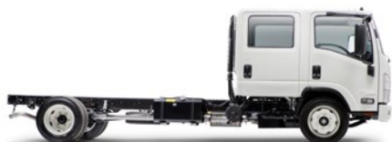
NQR 87/80-190 Crew