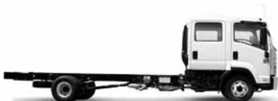
FRR 600 Crew