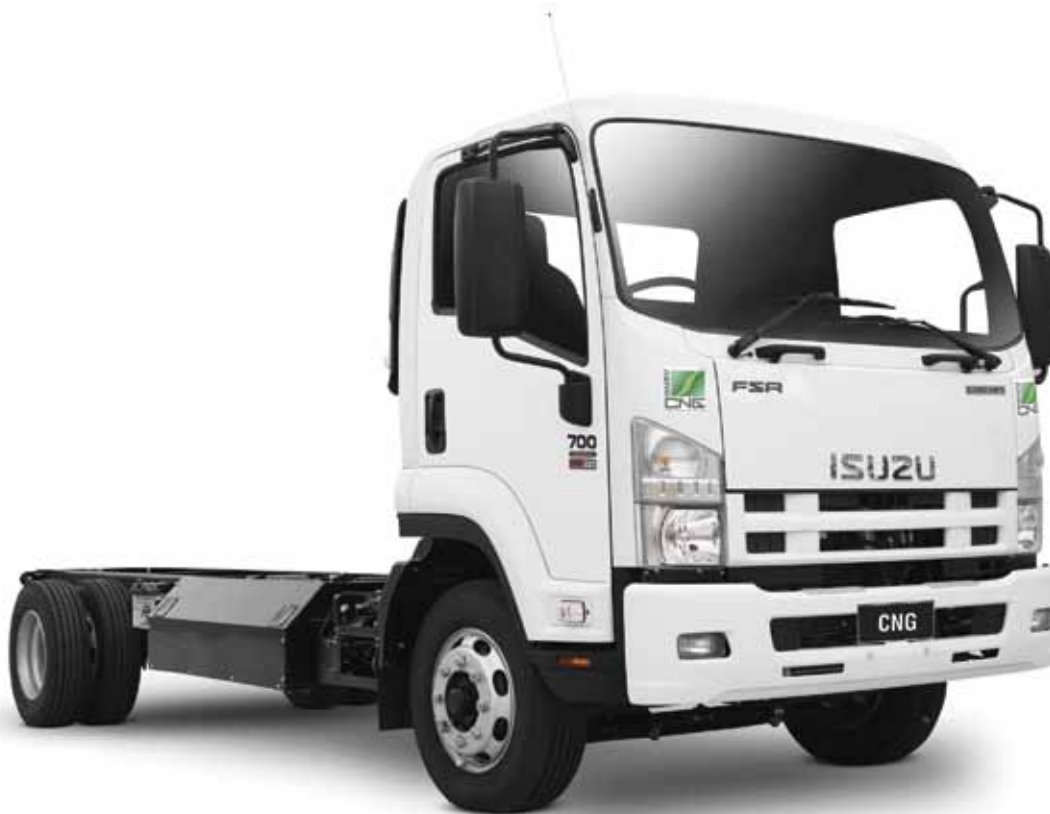
FSR 700 CNG

AUSTRALIA'S TOP SELLING TRUCK BRAND SINCE 1989.