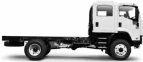
FTS 800 Crew