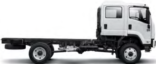
FTS 800 Crew