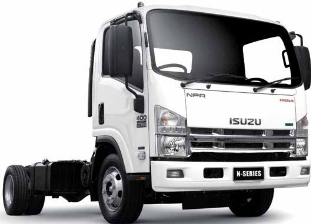
NPR 400 Premium

AUSTRALIA'S TOP SELLING TRUCK BRAND SINCE 1989.