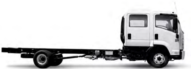
FRR 500 Crew