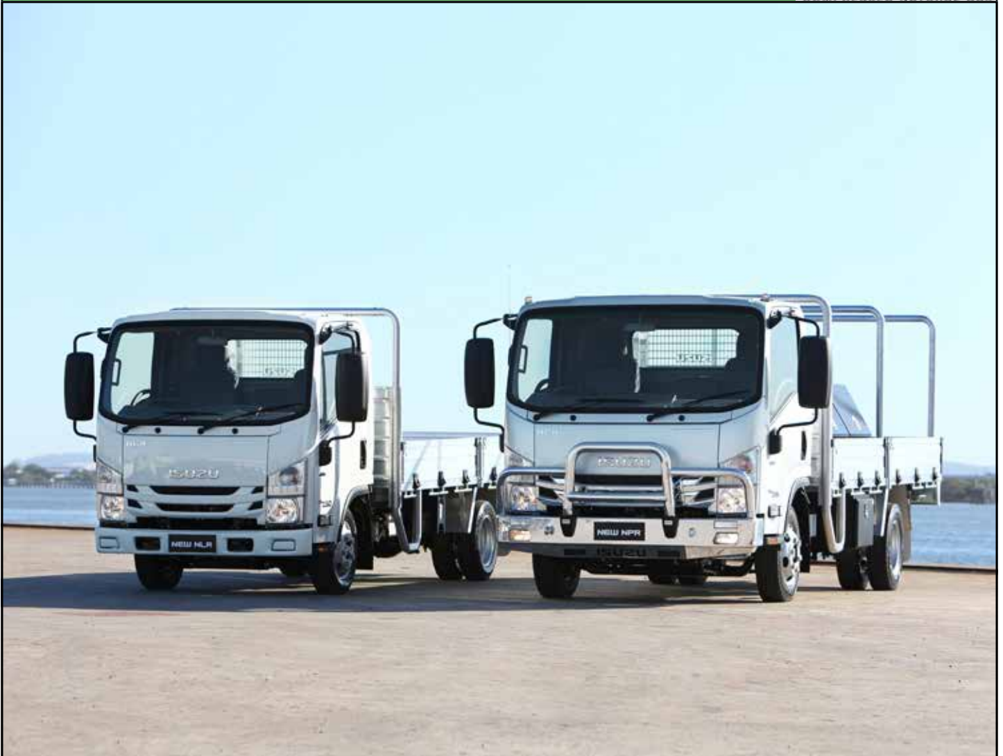
Images are for illustrative purposes only. NLR 45-150 Traypack and NPR 45/55-155 Tradepack pictured. Tray body and accessories shown are fitted to these models only.

AUSTRALIA'S TOP SELLING TRUCK BRAND SINCE 1989.