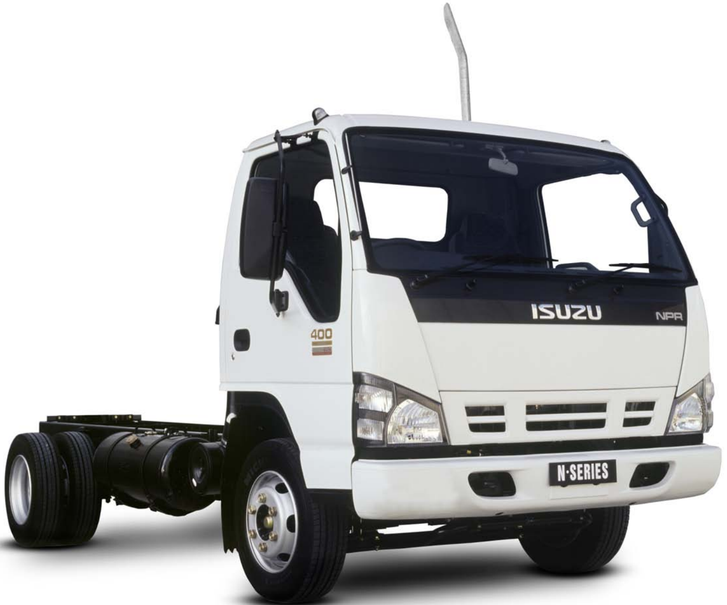
NPR 400 Medium pictured

(Crew cab model also available – refer separate specification sheet)