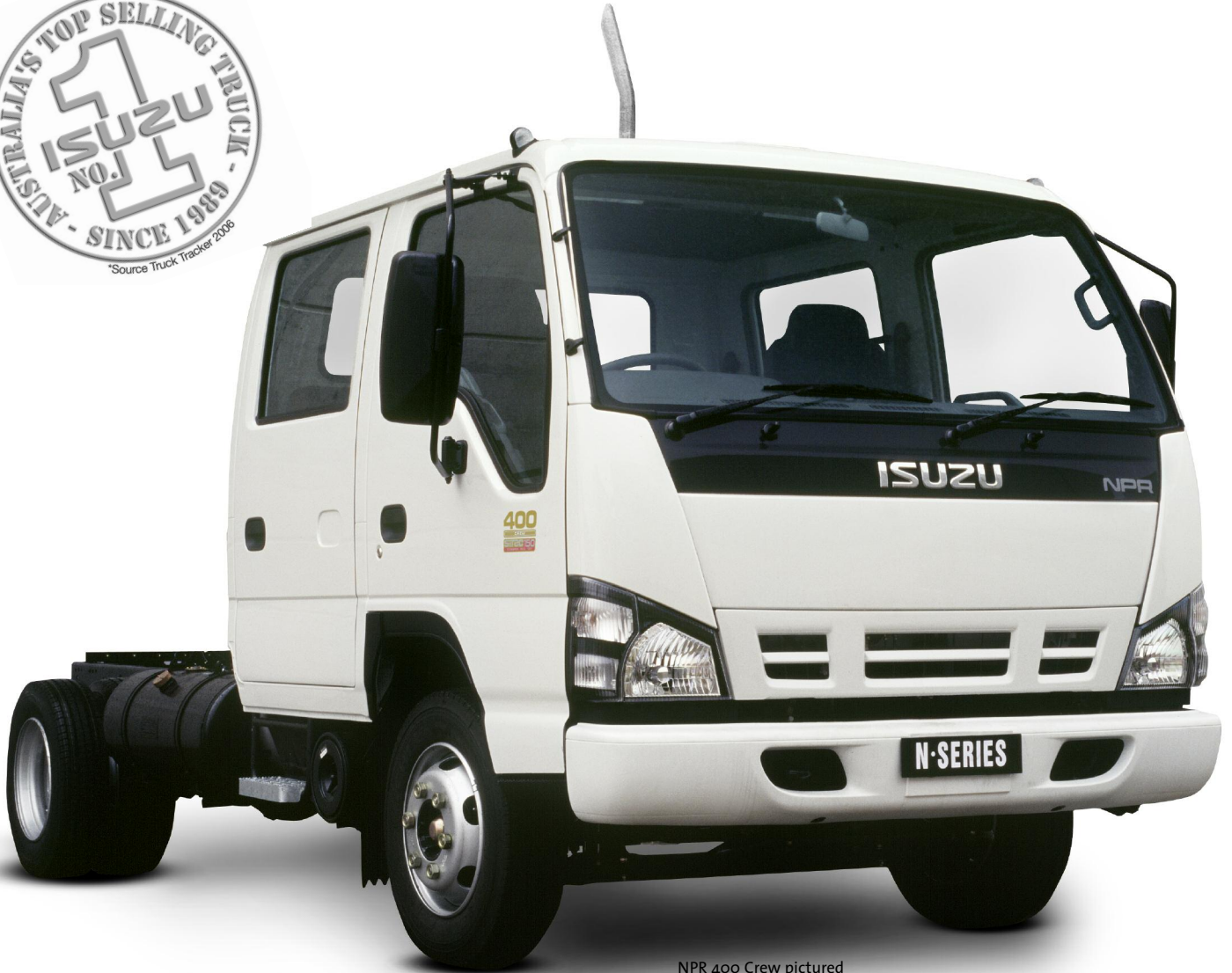
NPR 400 Crew pictured