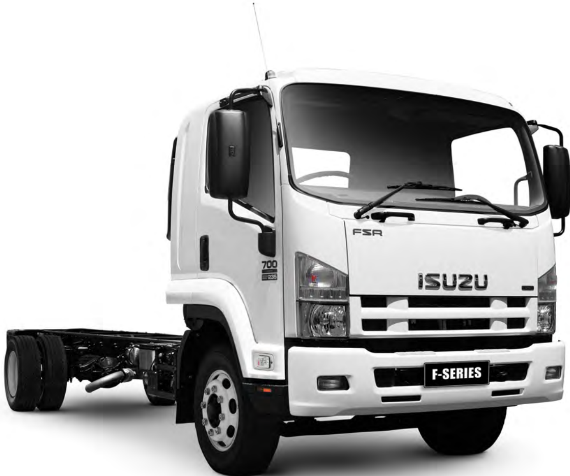
FSR 700 pictured

AUSTRALIA'S TOP SELLING TRUCK BRAND SINCE 1989. Truck tracker 2009.