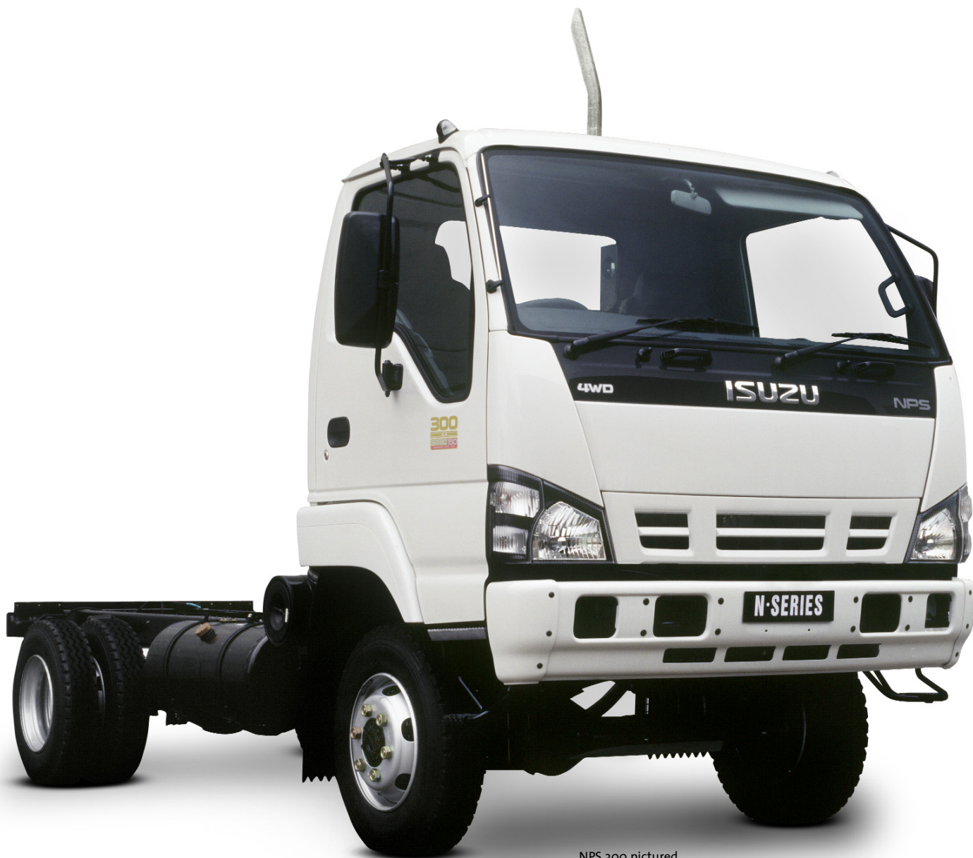
NPS 300 pictured