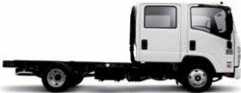
NNR 200 Crew