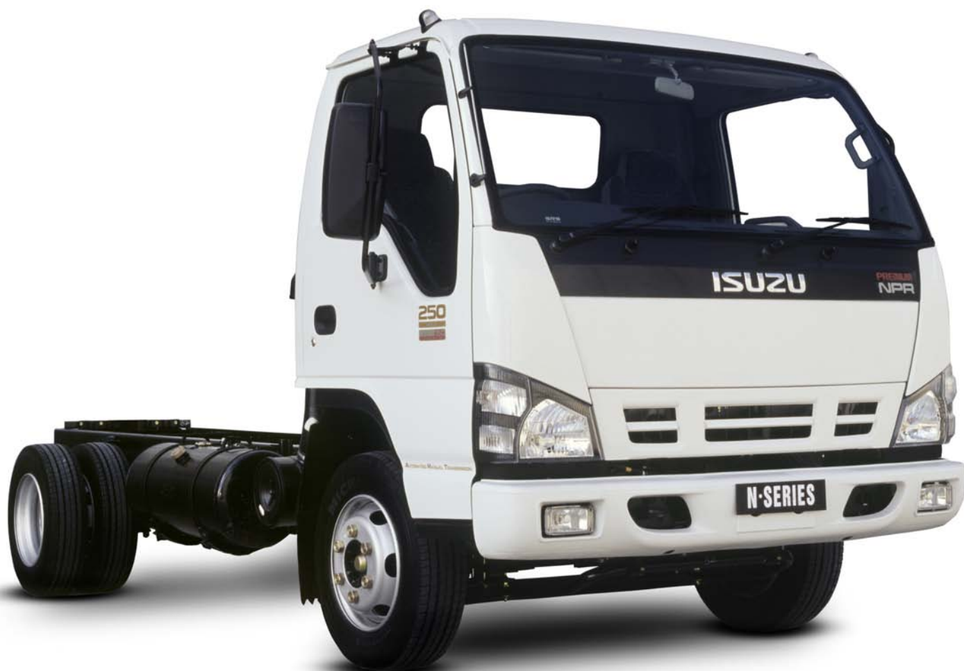
NPR 250 Medium Premium pack pictured

(Crew cab NPR 250 model also available – refer separate specification sheet)