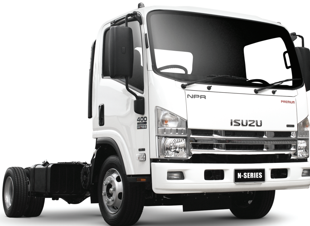
NPR 400 Premium pictured

AUSTRALIA'S TOP SELLING TRUCK BRAND SINCE 1989. Truck tracker 2009.