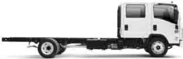
NQR 450 Crew