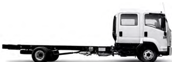
FRR 600 Crew