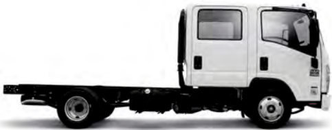
NNR 200 Crew