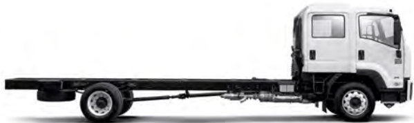
FTR 900 Crew