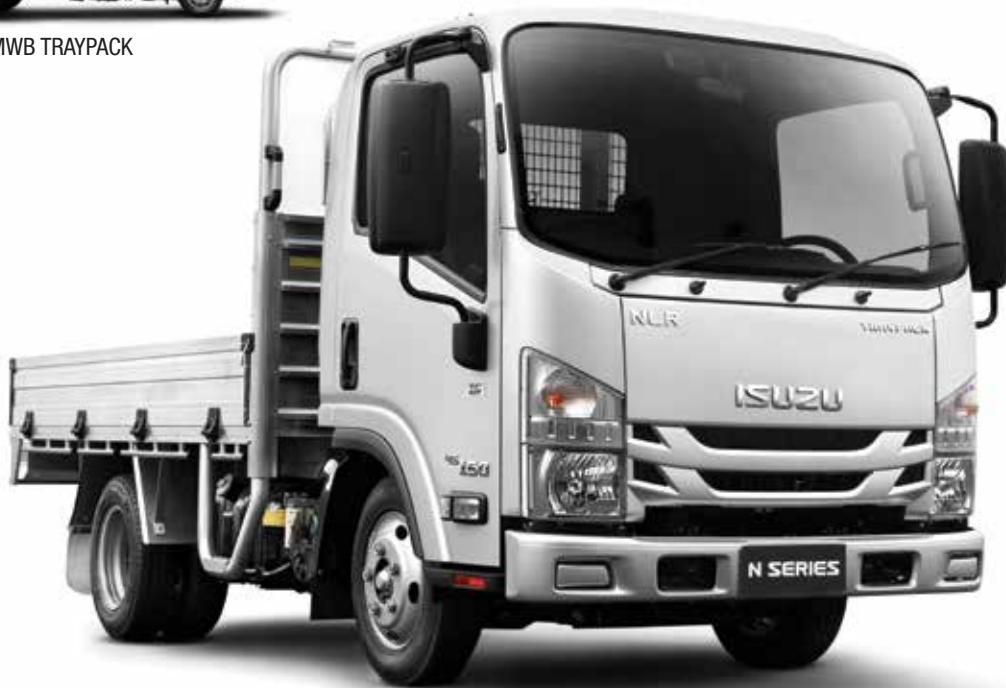
SWB PREMIUM TRAYPACK

Heavy duty aluminium tray / Integrated load restraint anchor points / Removable drop sides and rear tailgate Headboard including rear window protector / Isuzu reversing camera