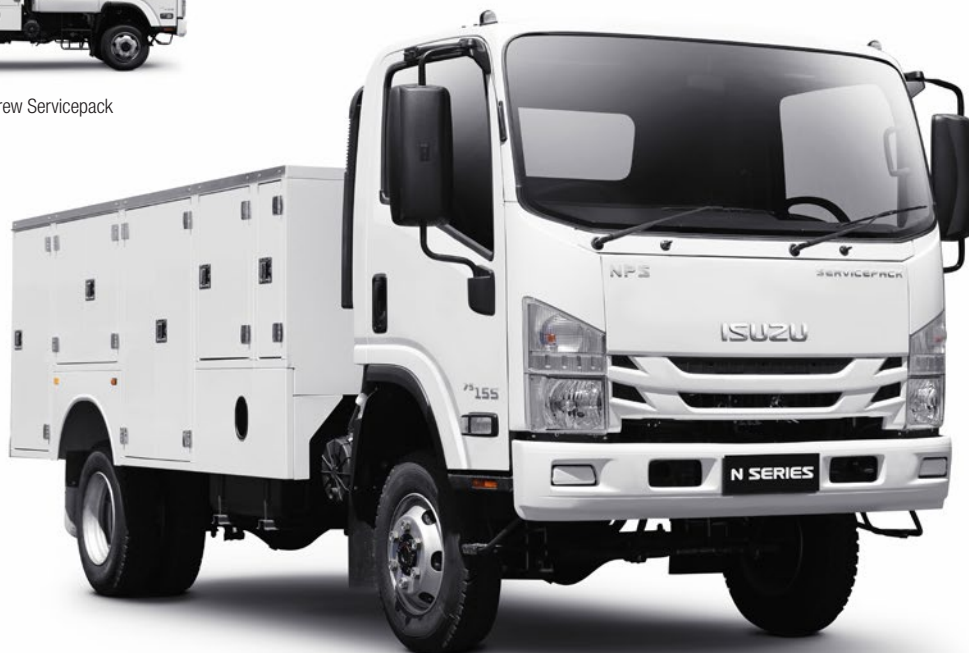
NPS 75-155 Servicepack

Fully powdercoated steel service body / Single cab: 9 lockable storage compartments Crew Cab: 7 lockable storage compartments / 4.0 cubic metre total volume / Single cab: 2.26 m x 1.17 m (L x W) central storage area with chequerplate floor and 5 tie down points. Crew cab: 2.16 m x 1.17 m (L x W) central storage area with chequerplate floor and 4 tie down points / Palfinger PC1500 crane (single cab only) / Storage compartment locking integrated with vehicle central locking system / LED lighting in each storage compartment / Rear barn door for central storage area (crew cab only) / Rear grab handles and non slip step surfaces / 3,500 kg rated towbar with integrated rear step / Isuzu reversing camera