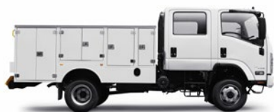
NPS 75-155 Crew Servicepack