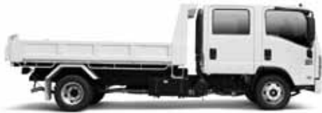
NPR 300 Tipper Crew